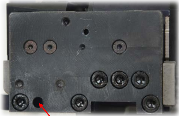
STRAP THICKNESS ADJUSTMENT